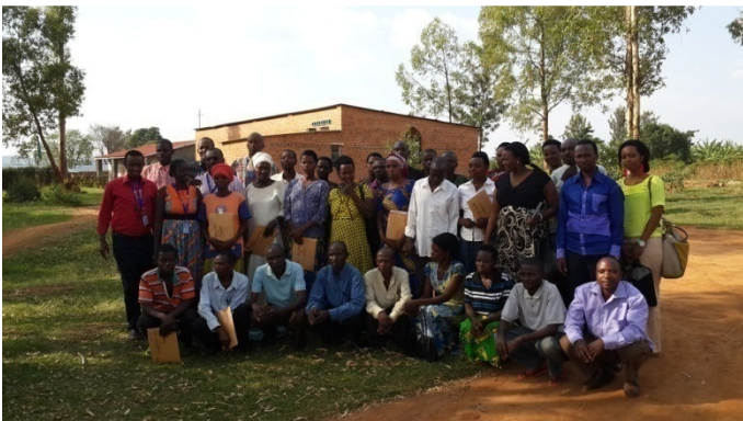
RWAMREC staff, partners and trainees after a test training session

This can be evidenced through the testimonies of the trainees. Indeed trainees testified that the training helped them to build their self-confidence which enabled them to freely share their feelings with their peers and partners. They also testified a better understanding of the importance of legal marriage as well as the negative effects of cohabitation; and pledged to legalize their unions, where relevant. In addition, trainees vowed to actively contribute to sensitizing their neighbors, friends and families, hence contributing to fighting against GBV and developing their communities