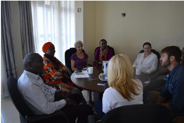
The RWAMREC Executive Secretary receiving US Fellows