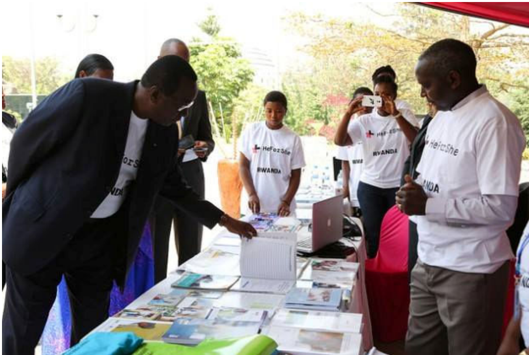
Honorable Bernard MAKUZA looking at one of RWAMREC manuals during the official launch of the HeForShe campaign